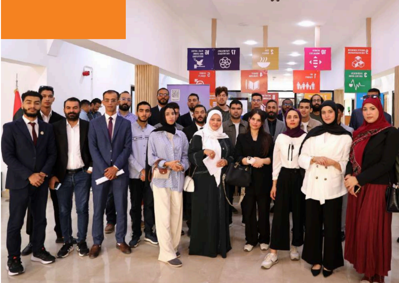
Group photo of some participants on one of YouEngage community violence reduction workshops at the UN compound, Tripoli - April 2025.