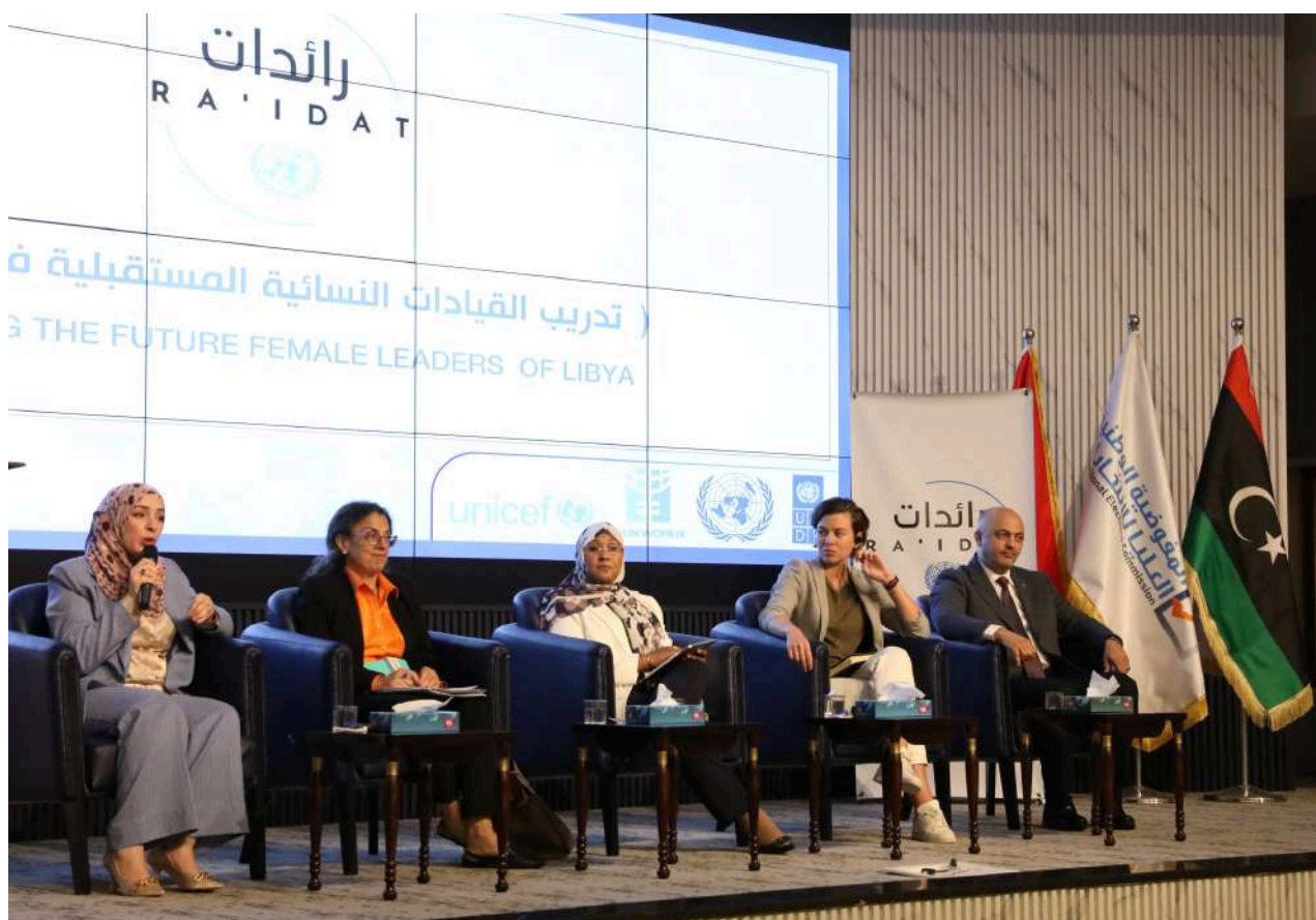
Panel discussion with representatives of the UN in Libya and the High National Elections Commission for the participants in the Ra'idat Programme, October 2024.

Working together with the UN in Libya, UNSMIL will also support youth skill and knowledge development in key areas of the mandate: the economy, community violence reduction and human rights, within the resources available to the Mission.