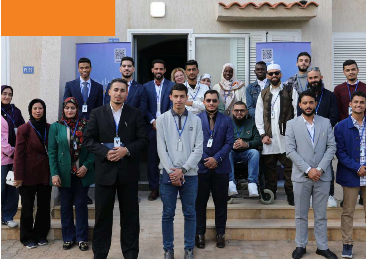
A group photo of participants in a discussion workshop on community violence reduction, April 2025.