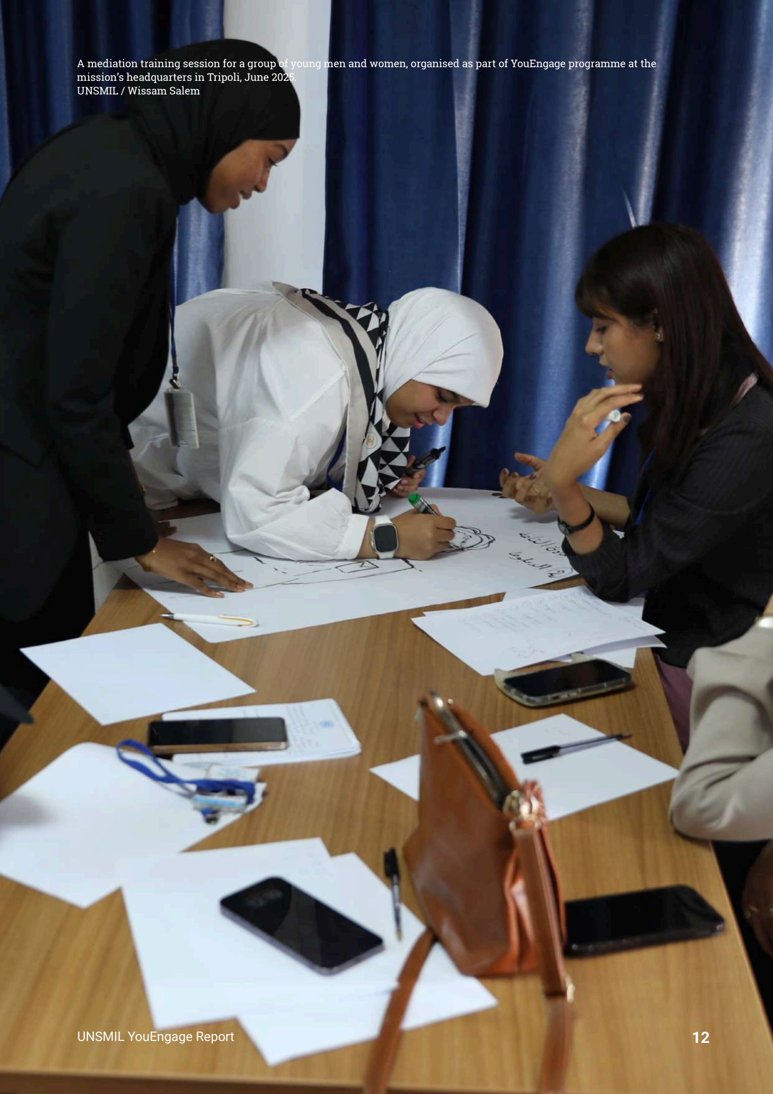
A mediation training session for a group of young men and women, organised as part of YouEngage programme at the mission's headquarters in Tripoli, June 2025.