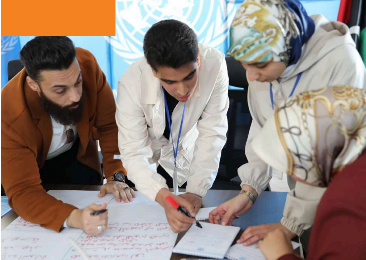
YouEngage discussion workshop in Tripoli on strengthening the ceasefire agreement, January 2025.