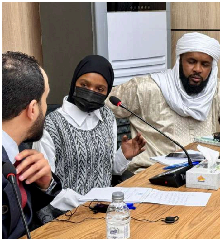
A discussion workshop on the political process with a group of youth from the eastern and southern regions in Benghazi, December 2024.