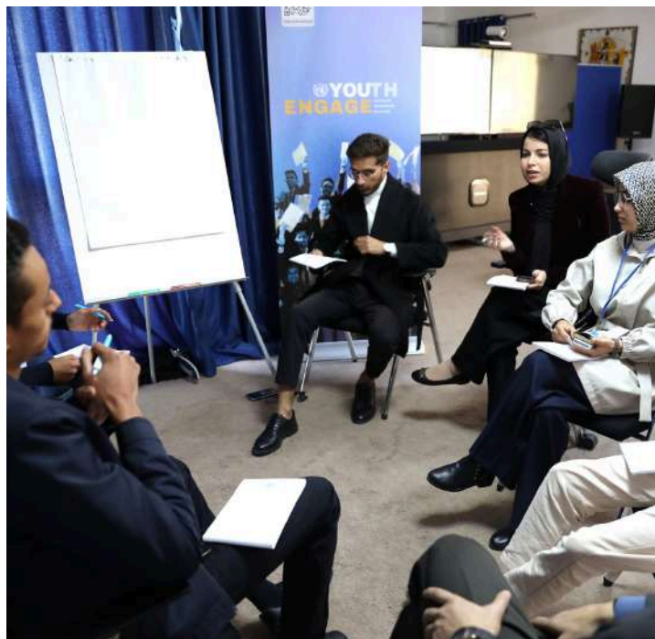
YouEngage discussion workshop in Tripoli on strengthening the ceasefire agreement, January 2025.

On average, each workshop lasted for 2-3 hours and started with a knowledge building presentation on the topic. The participants were split into breakout groups, ensuring they were made up of mixed regions and backgrounds where possible. After discussing key challenges, the group discussed ideas with and gave recommendations to UN officials. These were collated and published online after each session.