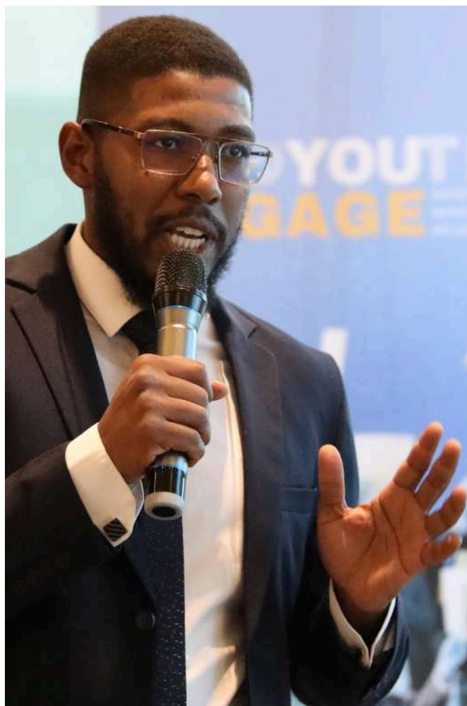
YouEngage discussion workshop on the political process in Tripoli, December 2024.

Fifty-per cent of youth asked for more opportunities to be involved in the media industry through the production of media articles and content and 36 per cent said there should be a greater focus on more positive news stories with 18 per cent saying they should include more diverse voices.