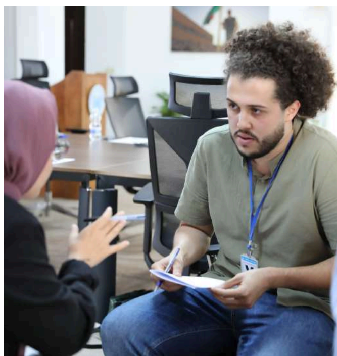
YouEngage discussion workshop on the future summit in Tripoli, September 2024.