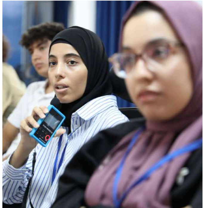
YouEngage discussion workshop in UNSMIL HQ, Tripoli - September 2024